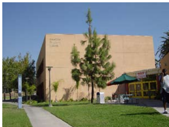
SSU lies on the north side of campus

On the first floor, there is a small shop that sells some snacks and