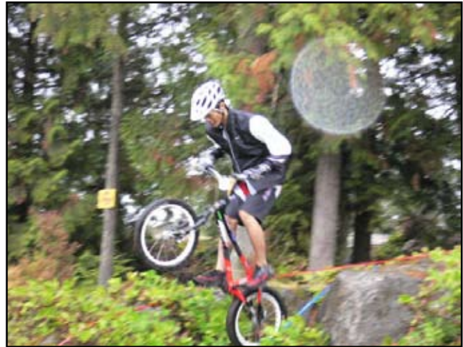
Flying through the air.