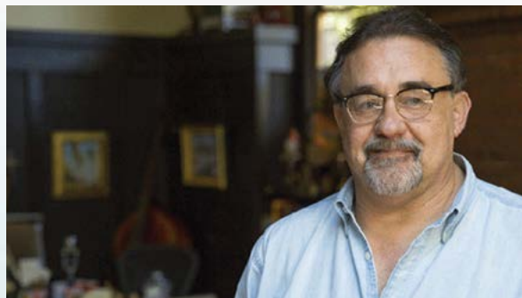
Don Hahn Producer, Walt Disney

When students graduate from CSUN, they join an extensive network of more than 330,000 alumni – in California, across the nation and around the globe – who thrive on helping Matadors find personal and professional success.